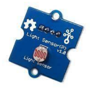
Figure 5- light sensor

Photo-junction Devices – These photo-devices are mainly true semiconductor devices such as the photodiode or phototransistor which use light to control the flow of electrons and holes across their PN-junction. Photo-junction devices are specifically designed for detector application and light penetration with their spectral response tuned the wavelength of incident light.